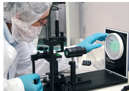
Different perspectives of a lab technician measuring the surface energy on a plasma cleaned, aluminum cap.