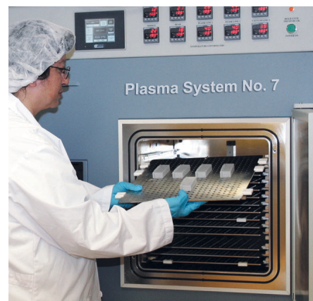
Device being treated for hydrophobicity.

Cons — The main disadvantage to plasma is the system price and throughput. The price of a system is related to the size of the system mainly due to